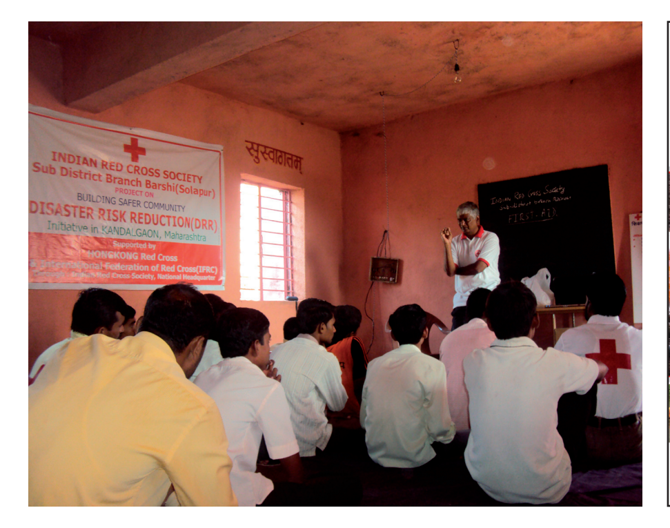
A training session on search and rescue held in Kandalgaon

that previously may have been missed until final evaluation can now be identified and addressed on an ongoing basis. The result of this collection of tools is more effective and efficient programming, based on community-directed needs. In-country partner National Societies of Indian Red Cross Society are also now using these tools to ensure that the programmes they support are effective. This monitoring mechanism has been incorporated in each level starting from grass root level i.e CDMC to IRCS national headquarters and IFRC India office.